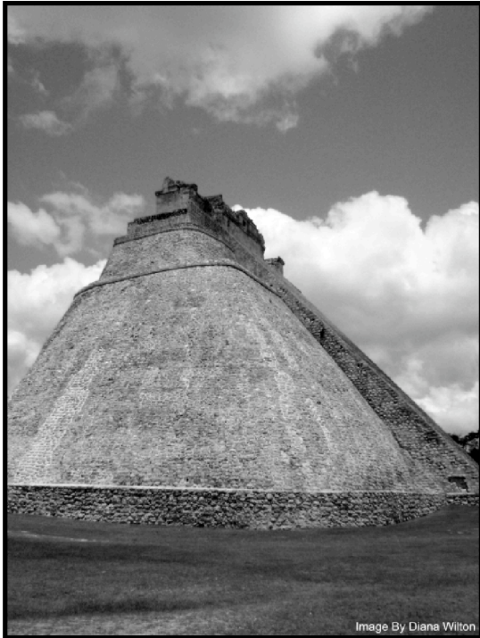
Temple of the Sun at Uxmal

Much can be said about the great changes, which the new millennium will bring. Many say that it is the end of our Mother Earth. This fatalistic mentality will soon come to an end itself.